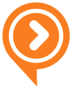
The Playaway "bug" logo.

The Flatwoods Branch library has these really cool, self-contained audiobooks called Playaway. They are a pre-loaded mp3 player that runs on a AAA battery. All of the controls are on the device. They are simple to use. They can be used with headphones, portable speakers, FM transmitters and cassette car adapters. They only weigh about 2 ounces and are about the size of an iPod and can fit in a pocket. There is