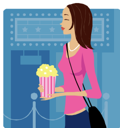
"Girl's Night Out @ the Flatwoods Library

For more information or if you have any questions stop in or contact the library.